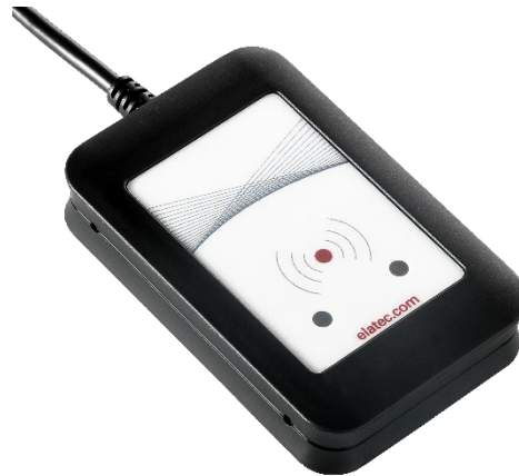
TWN4 MultiTech 2 (exemplary illustration)

The TWN4 MultiTech 2 family of contactless RFID readers and modules allows users to read and write to almost any LF and HF tags and labels. All products support NFC and, optionally, Bluetooth Low Energy (BLE). In addition, they are also compatible with the two most commonly used smartphone operating systems, Android and iOS, which gives the option to integrate them in mobile identification applications. The desktop readers are available as Plug & Play devices that can be easily customized (i.e. inlay design), whereas the PCB modules offer a large amount of interfaces and a perfect form factor for an easy and quick integration in any host device. This broad range of product features makes the TWN4 MultiTech 2 family an excellent solution for almost every project.