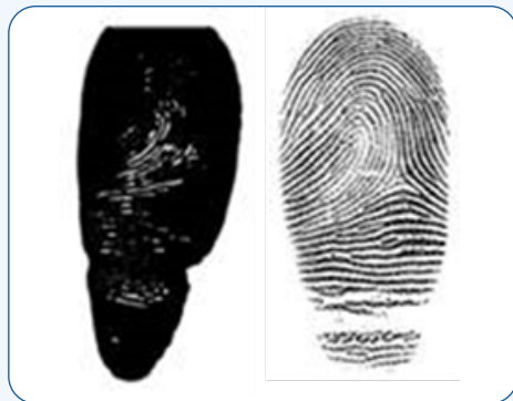
Wet print vs. normal print