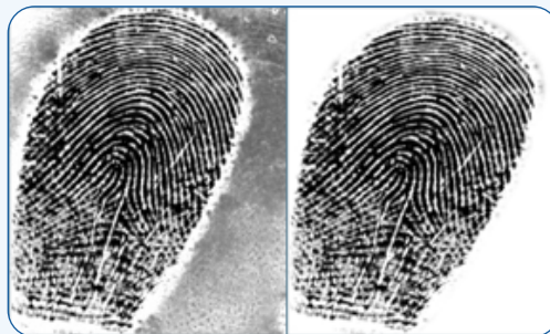
Example of an image before and after the elimination of the noise

The ability to eliminate the noise around a fingerprint image leads in better matching results. This feature automatically cleans the irrelevant areas around the fingerprint, letting the matching algorithms focus on what's most important. Dirty pixels from the final image will also be removed.