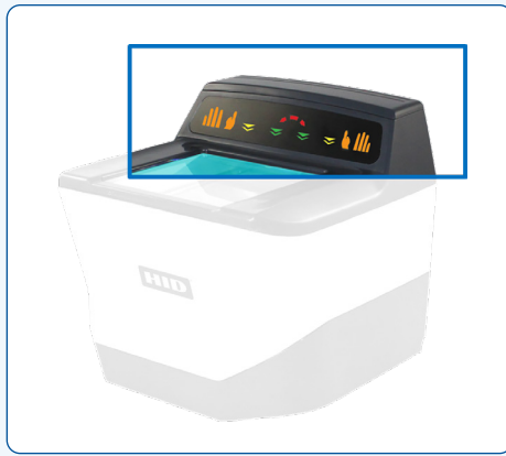
Example of a superior user guidance with pictograms on HID® Guardian™ tenprint scanner